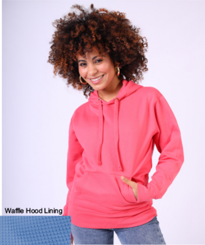
Waffle Hood Lining